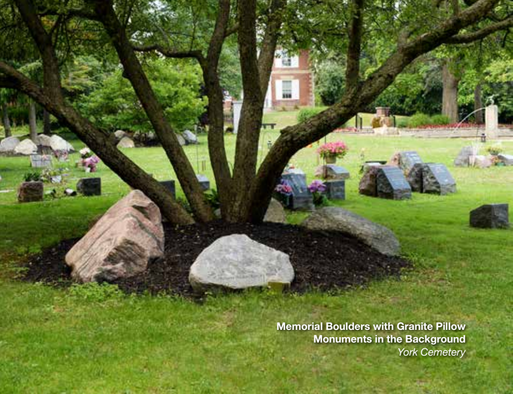
Memorial Boulders with Granite Pillow Monuments in the Background York Cemetery