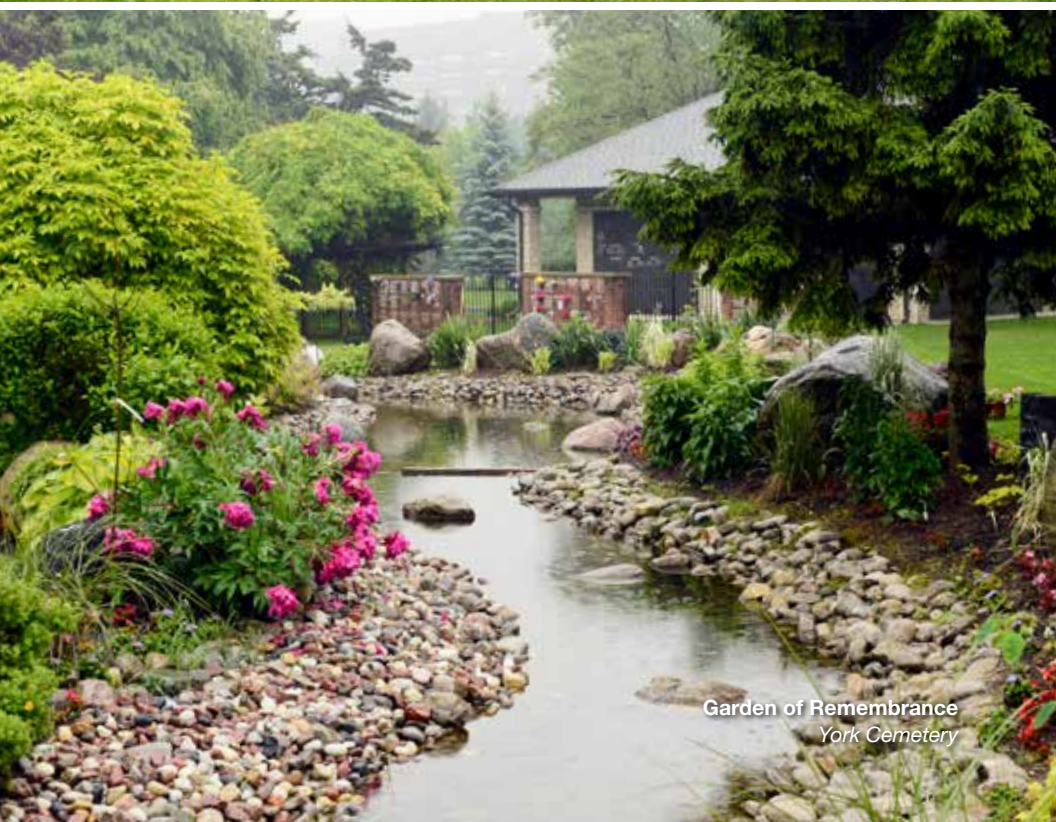
Garden of Remembrance York Cemetery