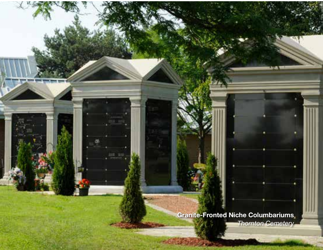
Granite-Fronted Niche Columbariums Thornton Cemetery