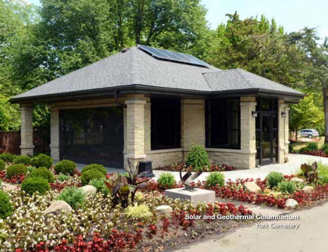
Solar and Geothermal Columbarium York Cemetery