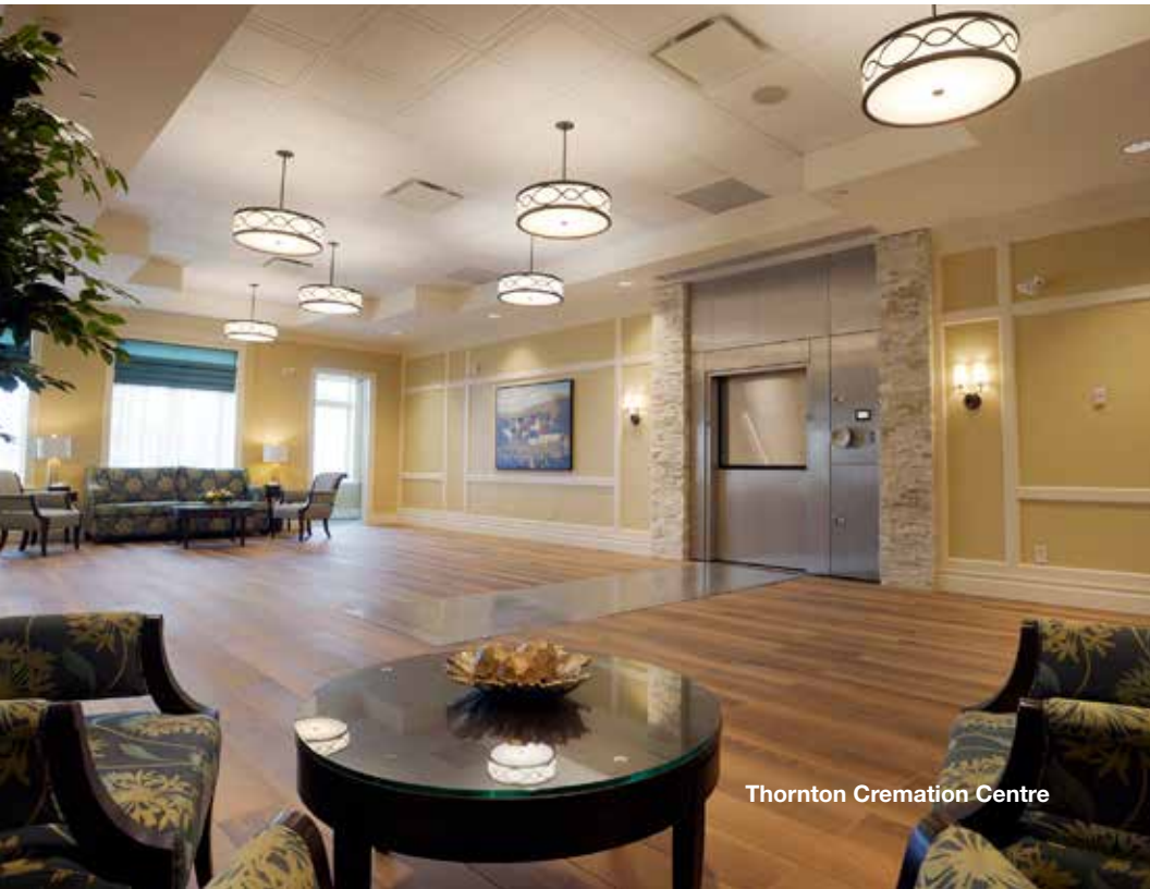
Thornton Cremation Centre