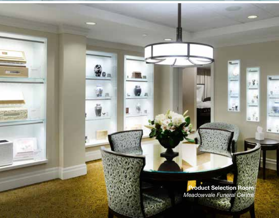
Product Selection Room Meadowvale Funeral Centre