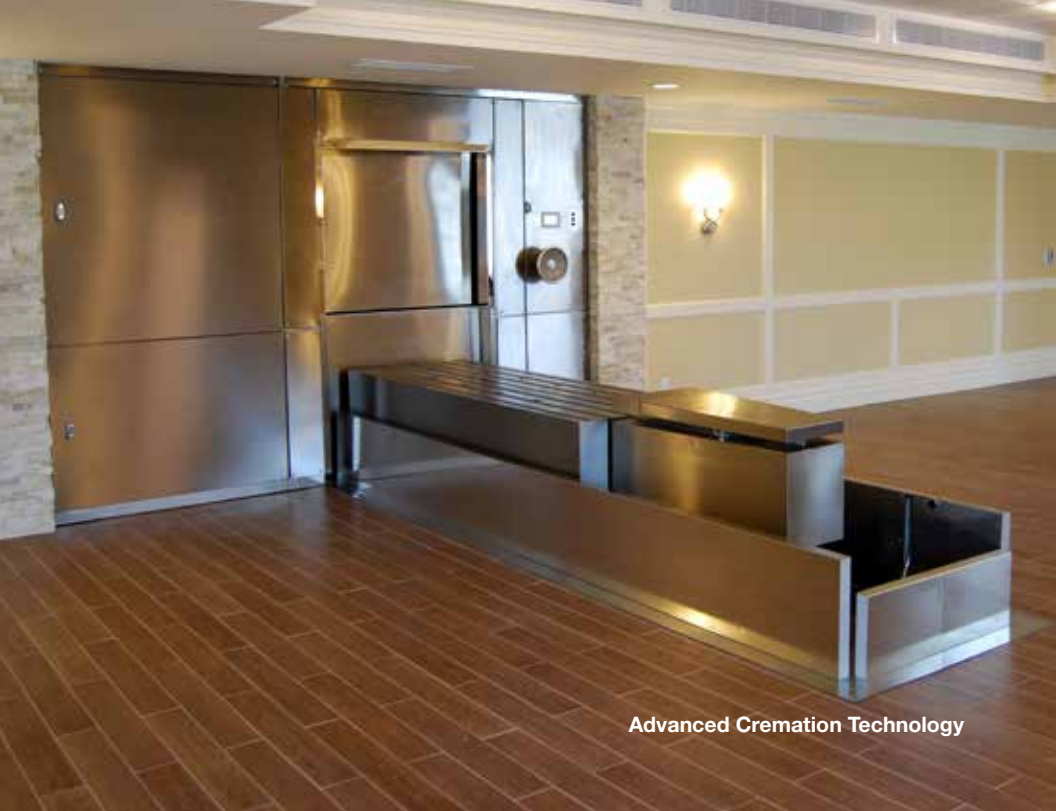
Advanced Cremation Technology