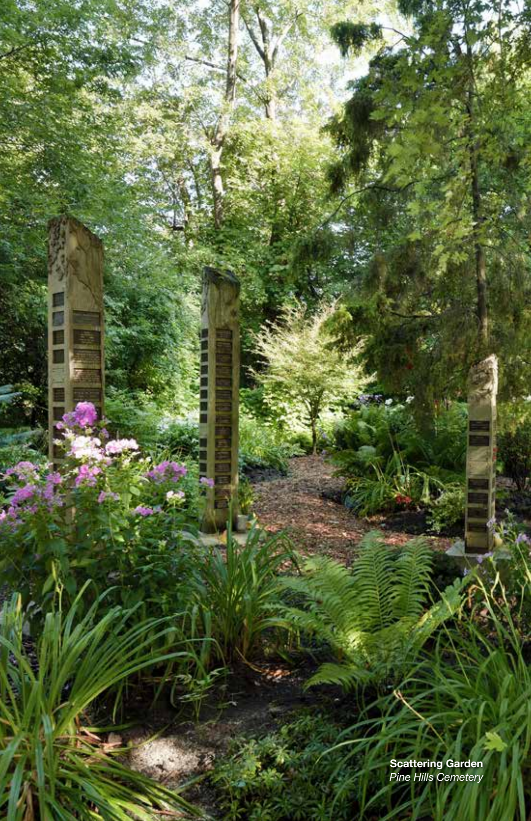
Scattering Garden Pine Hills Cemetery