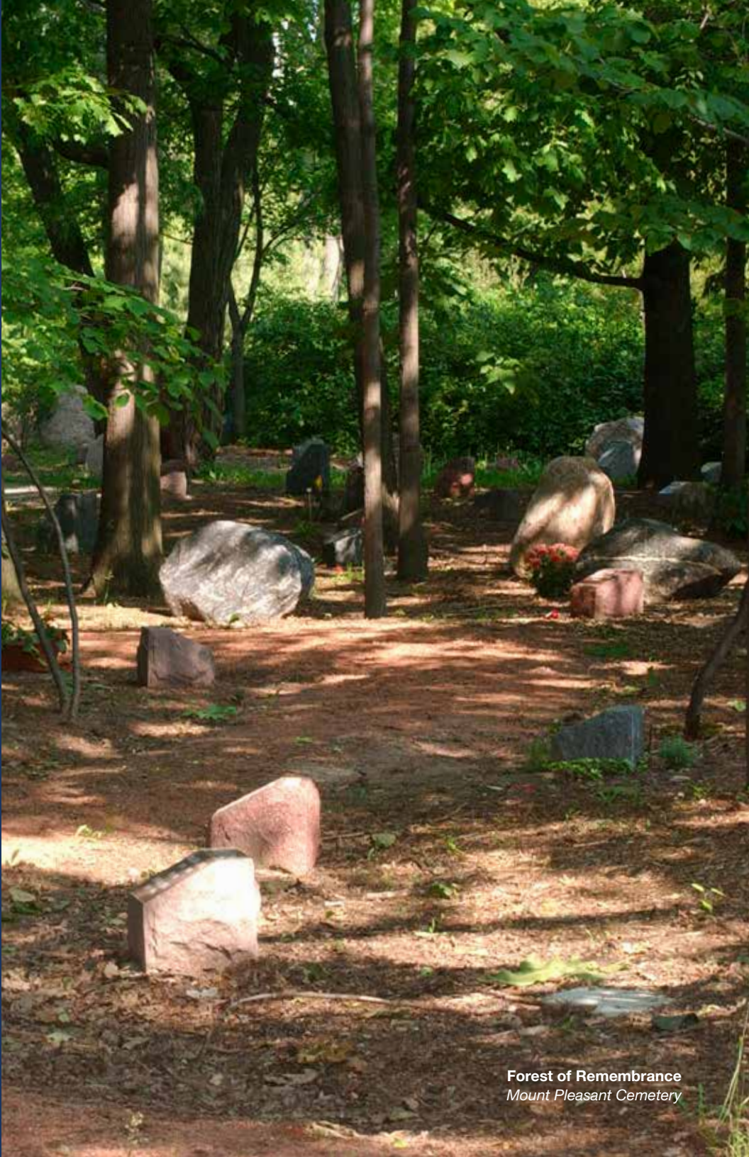
Forest of Remembrance Mount Pleasant Cemetery